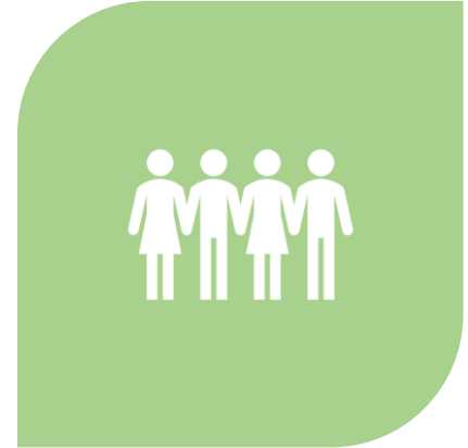
DRIVE INTERAGENCY GROUP