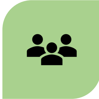
DRIVE LIAISON NETWORK