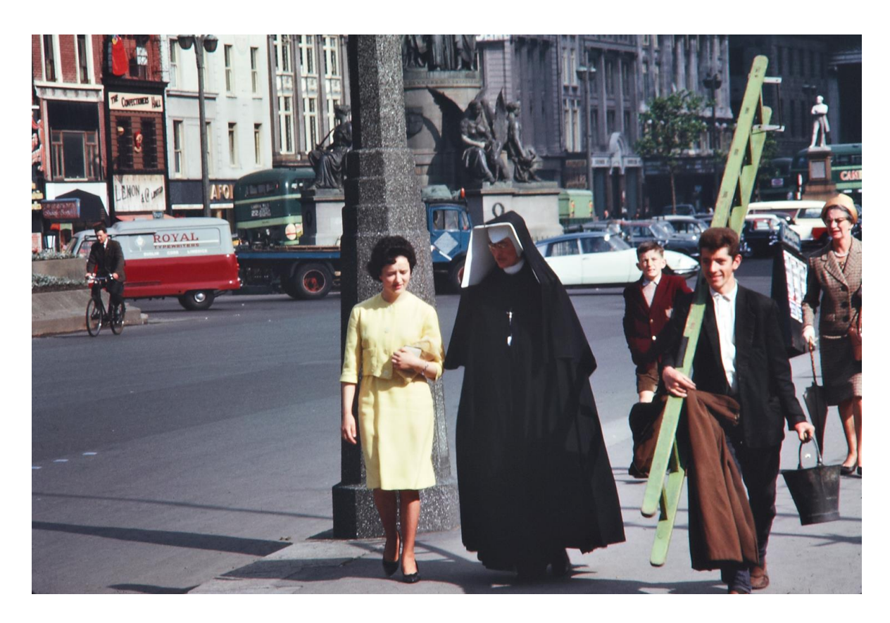
View of O Connell Street, Dublin, June 1963